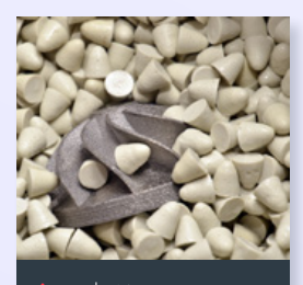
3dpbm Insights AM Post-Processing The key to scalable, industrial AM toget 201