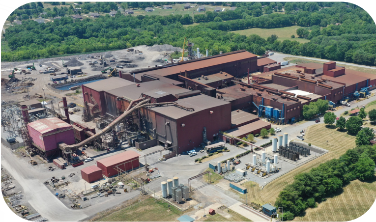
Powder Production Center in Gallatin, Tennessee

Customizable Product - Powder chemistry, size, and shape can be modified to fit the needs of end user