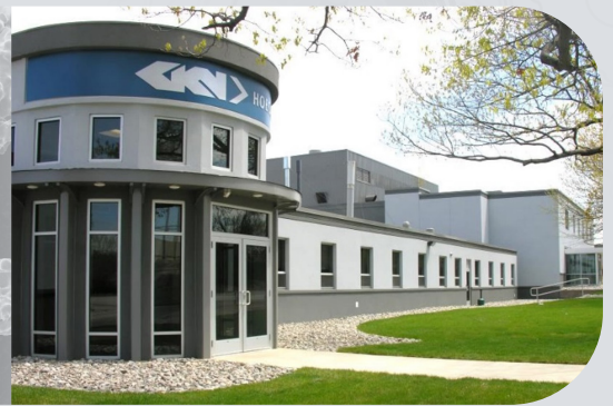
Powder Innovation Center in Cinnaminson, New Jersey